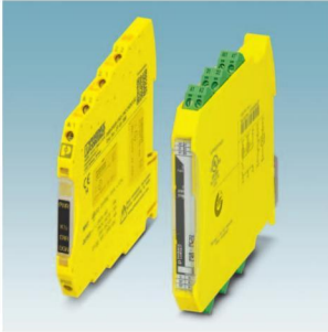
Alternative illustration as 1001 structure