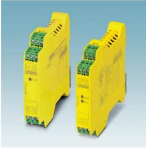
Alternative illustration as 1001 structure